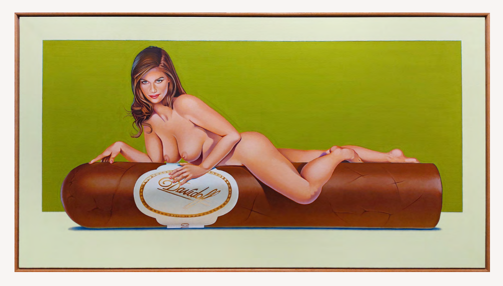
255.000 USD for Mel Ramos' Hav-a-Havana #6