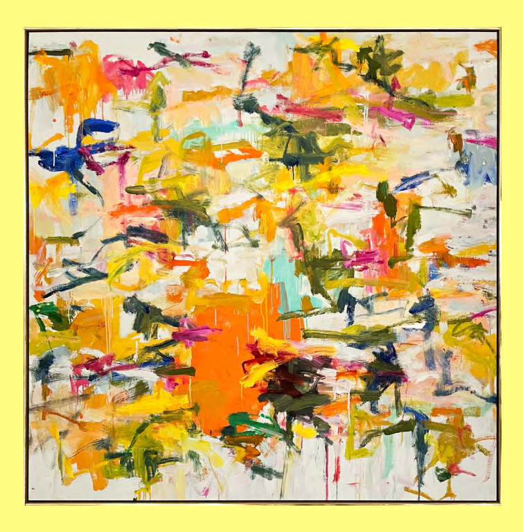
Kiku Saito, Sea Rose, 2013, sold on Artnet Auctions for 162,500 USD

Top lots during the first quarter of 2023 included Pop Artist Mel Ramos' 'Hav-a-Havana #6', which realized 255,000 USD including premium ; Sculptor Manolo Valdés' 'Damas de Barajas', which hammered down at 212,500 USD including premium ; as well as Andy Warhol's 'Flash (complete set of 11 works),' which realized 137,000 USD including premium .