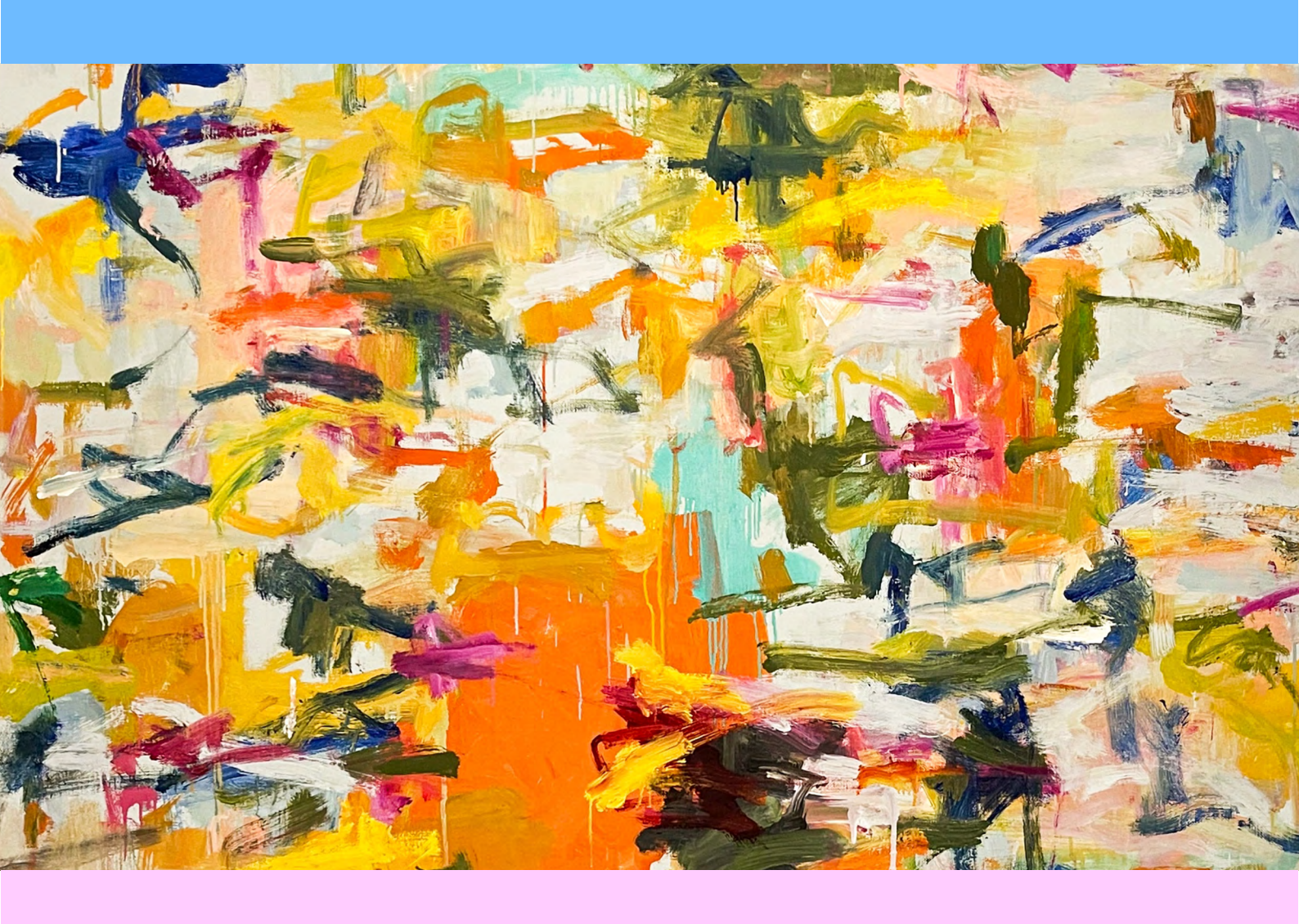
Artnet AG Quarterly Interim Statement for the First Quarter 2023